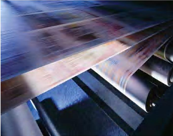
Material transport systems like this example in a printing works are just one of the many applications for the new FR-E700 series.