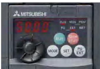
The installed Multi User Panel with the Digital Dial

In addition to entering and displaying parameter values, the integrated LED display is also used to monitor and check operating values and alarm codes.