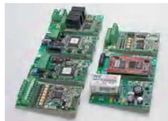
Option cards for additional functions

Functions can be added with option cards and additional I/O modules to configure the system for individual applications and requirements.