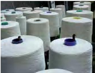
Mitsubishi frequency inverter drives are now standard equipment in the textile industry.