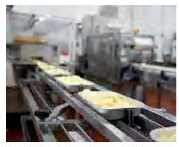
Conveyor belts and chain conveyors are an ideal application for the FR-D700.