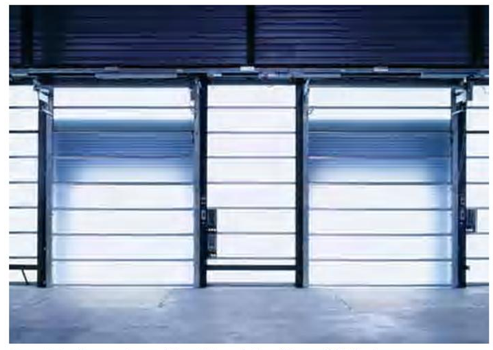
Door and gate drives are only some of the multiple applications of the new FR-D700 series.